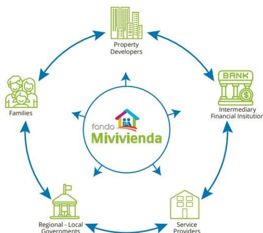
Figure 1: Fondo MiVivienda Memoria Anual 2020

Fondo MIVIVIENDA S.A. is a wholly owned government entity established in 1998 under the Law N° 26912 as “Fondo Hipotecario de Promoción de la Vivienda - Fondo MIVIVIENDA” in Peru. Afterwards, pursuant to Law No. 28579, FMV was established as a for-profit organization, as part of the Ministry of Housing, Construction and Sanitation umbrella. FMV operates in both primary and secondary mortgage markets by partially originating loans to borrowers, acting as a mezzanine lender that provides funding to Intermediary Financial Institutions (IFIs), which in turn lend to the target segment final borrowers. FMV key products consist of PEN denominated mortgage, partially subsidized by the Government, via two main programs, (i) Programa MiVivienda and (ii) Programa Techo Propio. FMV provides affordable housing to low- and middle-income families and individuals in Peru. FMV is one of the 35 corporations ruled by Fondo Nacional de Financiamiento de la Actividad Empresarial del Estado (FONAFE), a business conglomerate directly owned by the Peruvian Government.